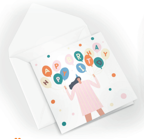
148 x 148 square cards also available at the same price as A5